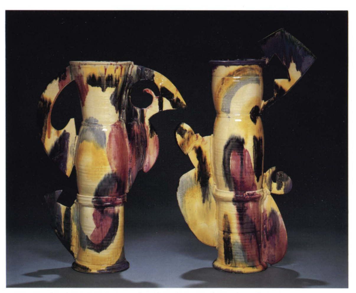
Kimono Vases "Plum Blossom" (view B), 1991, 38 1/2" x 44" x 9 1/2"