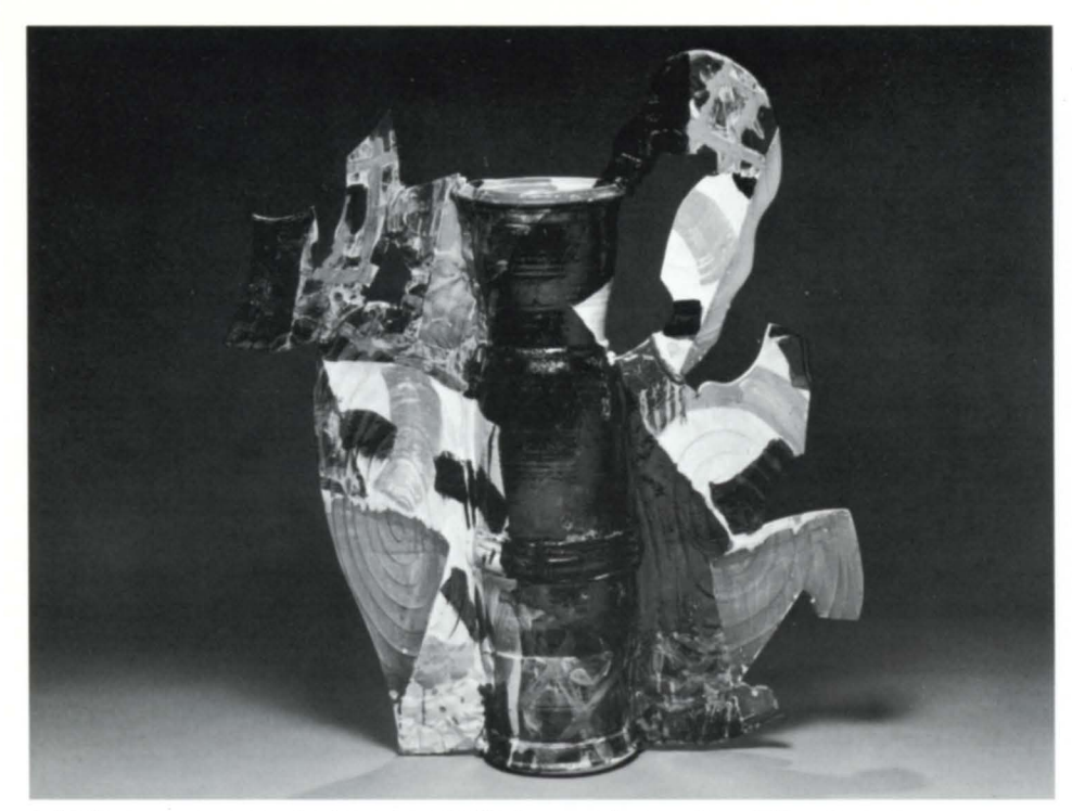
Still Life Vase, no. 17, 1991, 42 1/2" x 39" x 10 1/4"

sit on shelves attached to the wall; they have a definite front and back. In this way, they align themselves more with painting, which traditionally has been hung on a wall and seen from the front only, than with sculpture, which was usually intended to be freestanding in space. The same is true of Kachina (1985), in which a vase with a false front (like a stage set) sits on a narrow wall shelf; its handles are behind it, flattened and fastened to the wall. In other pieces, Woodman takes the three-dimensional form of a pitcher and turns it into an outline or silhouette; she makes shadows tangible and timeless by cutting them out of clay and positioning them where an object's real shadow would fall.